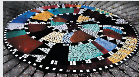
'The Circle'- David Wacker, 5 years old